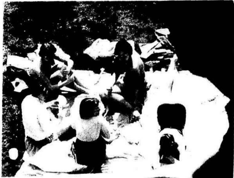
WORK FOR THE "NEWS" and all this can be yours. The gentleman prefers to remain anonymous.