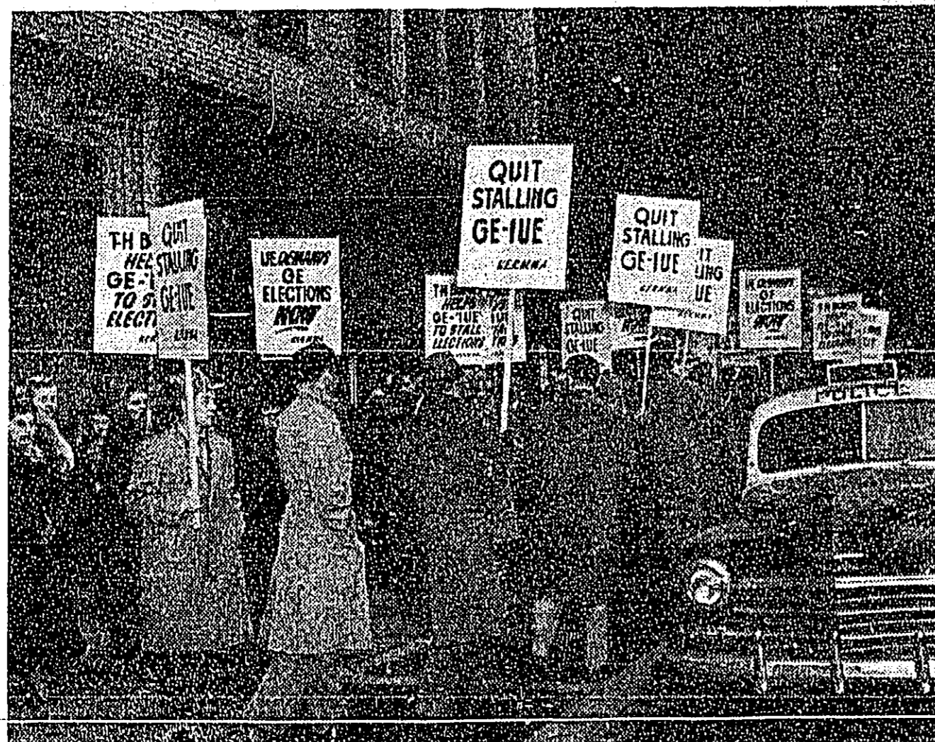
These pickets, demonstrating outside the building where the NLRB hearing is being conducted on the GE election, include members of Local 301 and of UE locals at Philadelphia and Newark GE plants. The demonstration was staged in hopes of speeding up the election.

The total amount turned in at the 301 office by Wednesday for the March of Dimes was $2,223.76. Stewards who haven't handed in their collections yet are asked to do so immediately.