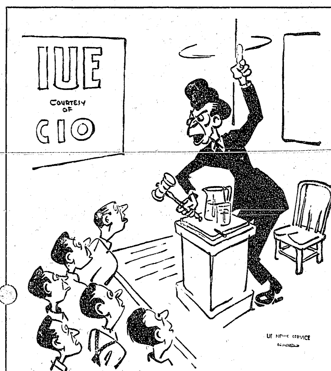
"And anyone who wants to see this contract I signed is a Communist."