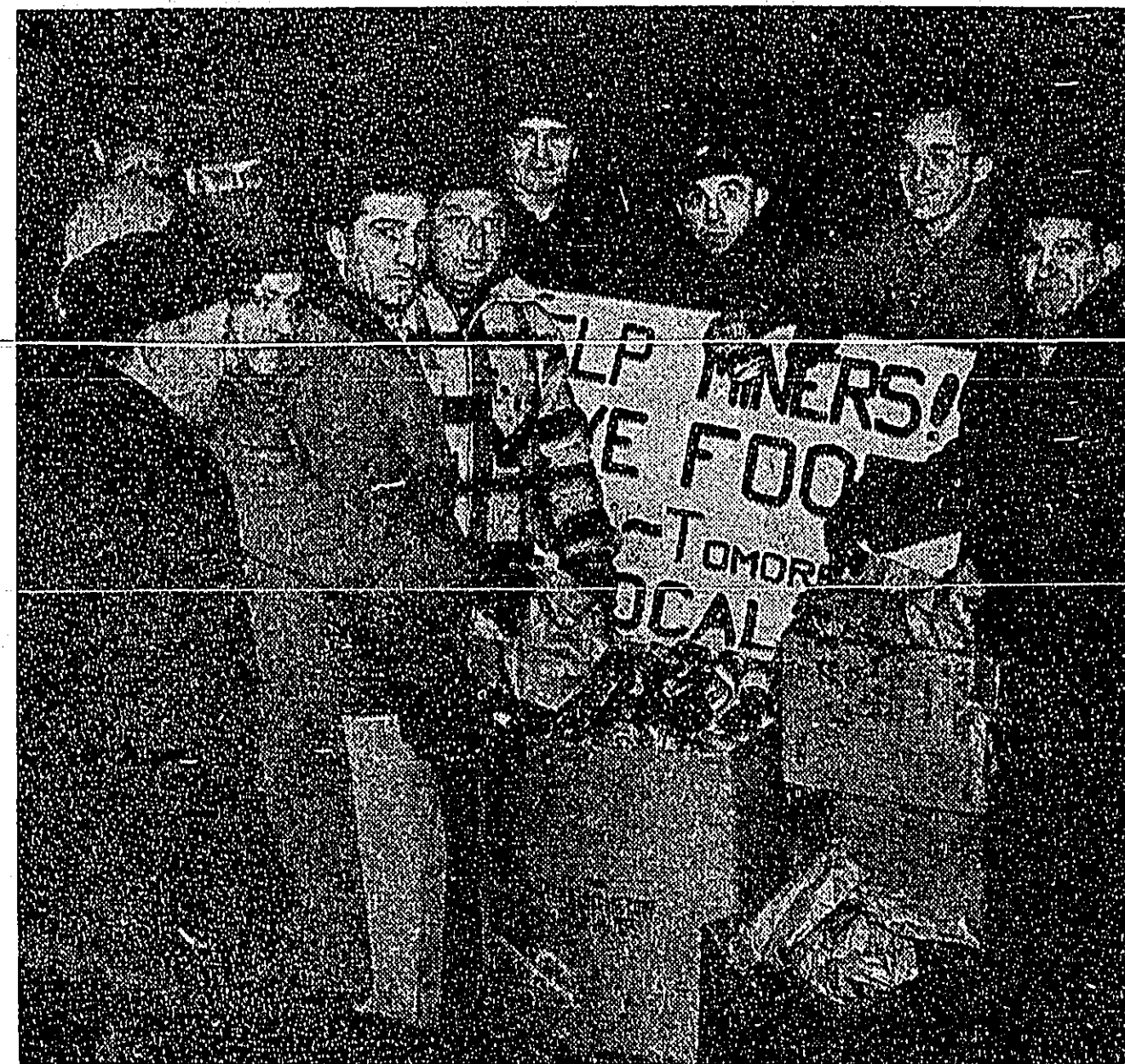
Members of UE-301 with food they brought to the Subway gate to send to the striking mine workers. The truckload of food from 301 was scheduled to leave this week, after the strike was settled. But the food was still urgently needed.