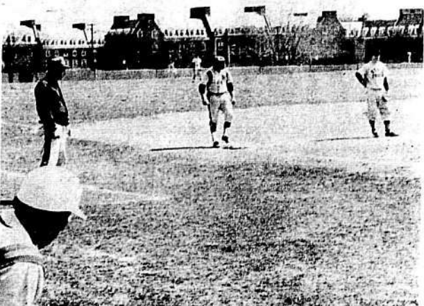
STORY OF THE SEASON is shown clearly - enemy frosh base runner in scoring position.

Big batsmen for Stater were Odorizzi (2 singles, triple, 2 RBIs) and Ingino (2 singles, home run, 4 RBIs).