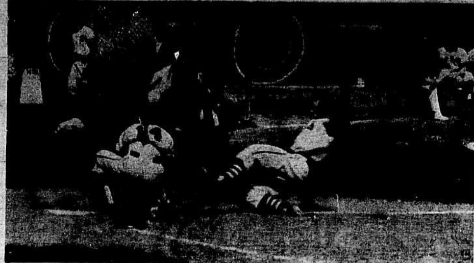
STATE RUNNER is about to be tagged out as New Haven catcher is poised to do the job in last week's 19-3 clobbering of the Peds.