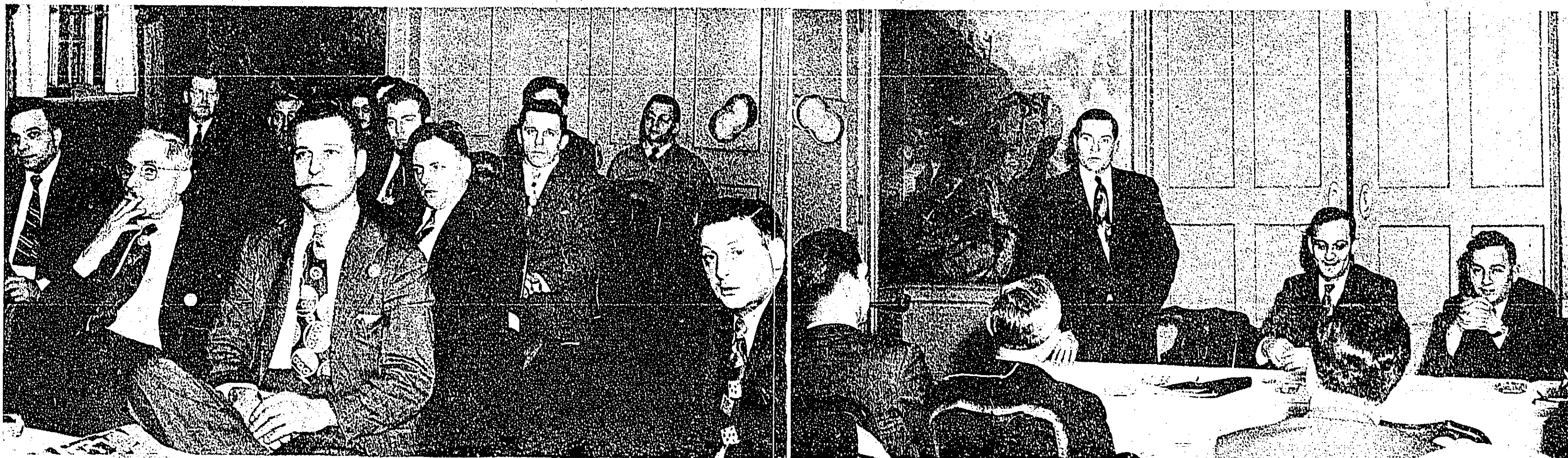
IUE delegates to last week's District 3 meeting in Schenectady heard reports from each local union, and drew up plans for better coordinating district activities after the NLRB elections. Delegates pointed out that under UE the District set-up was used as a propaganda sounding board for communist agencies. Re-organization plans will be submitted at the next conference in Elmira, N. Y.