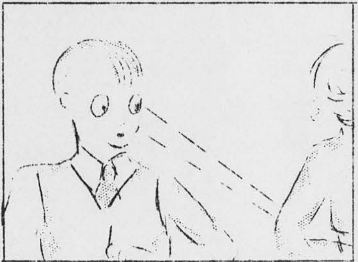
HAVE FUN OVER THE WEEKEND?

It certainly is a big relief to have exams over at last. Just three more months of relaxation until it's time to start studying for exams again.