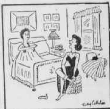
"He has everything — good job — sports car — Blue Shield!"