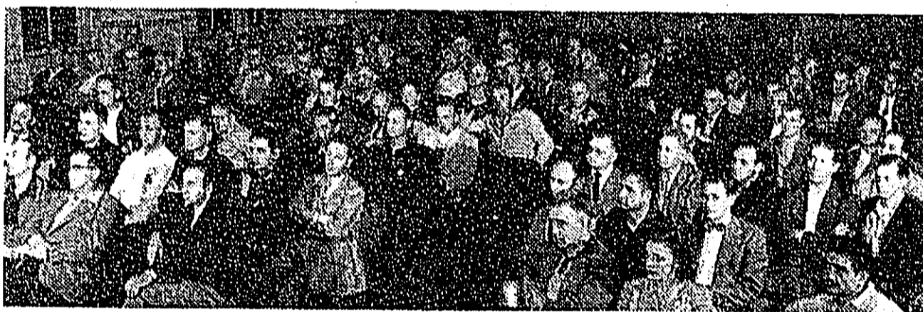
Members at Tuesday night meeting when they unanimously reaffirmed vote to unite the GE chain. Story on Page 2.

Board members are now in the process of giving Stewards and Members a detailed report in the shop.