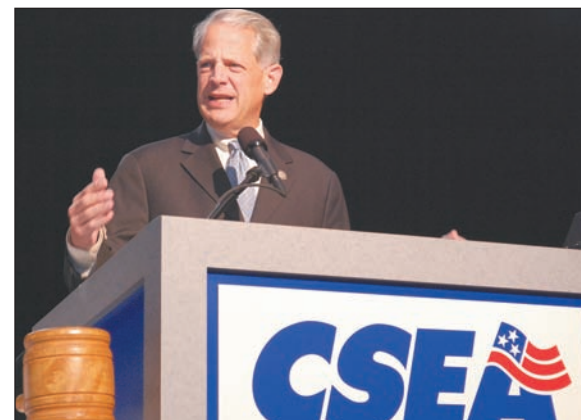
U.S. Rep. Steve Israel addresses CSEA's 102nd Annual Delegates Meeting.