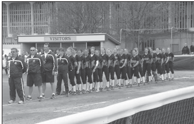
Team Lines Up For National Anthem