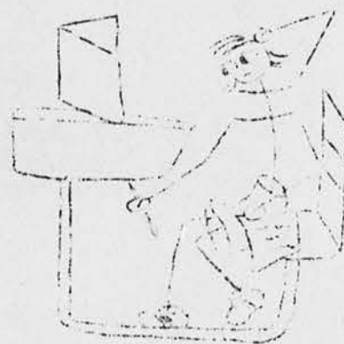
THE WRITING AND GRAMMING