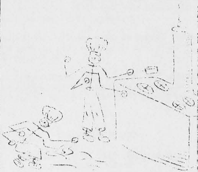
THE COOKING CLUB