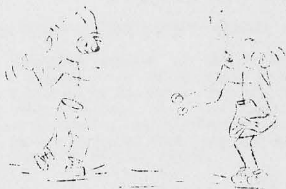
OUR BOARD GAMES