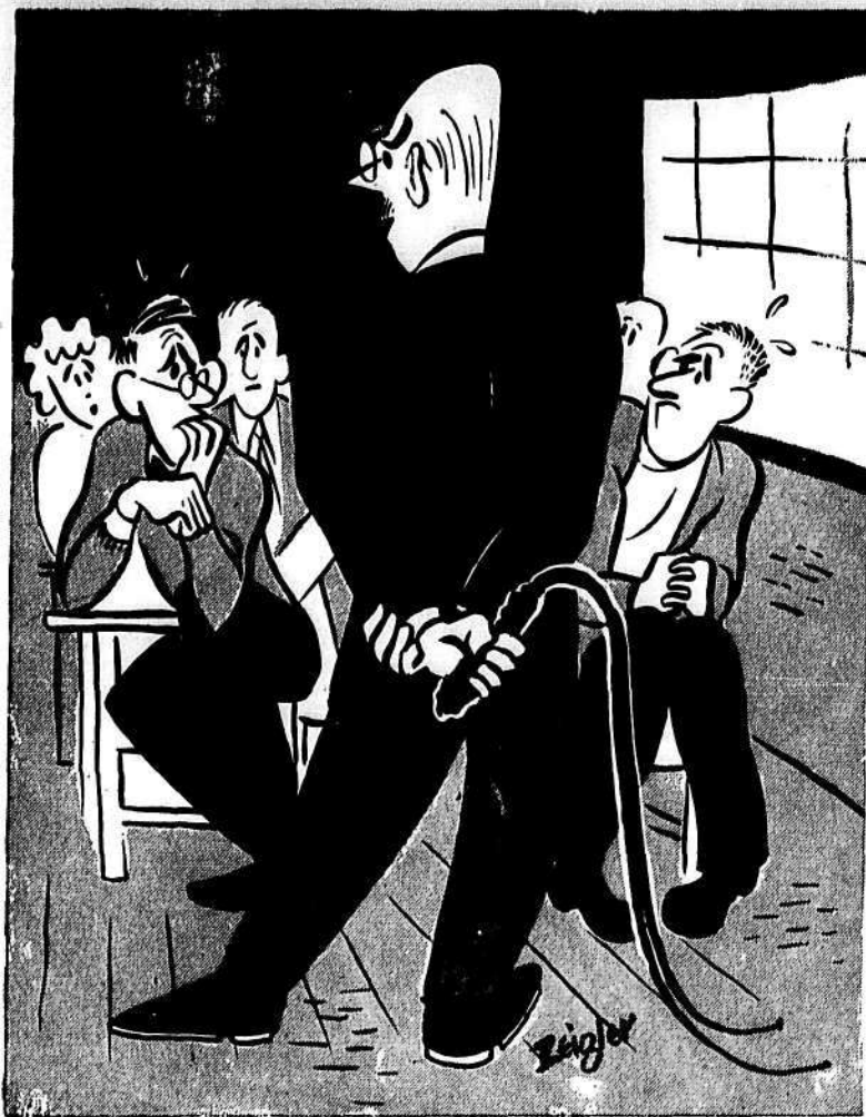
"... and, I think, I may now speak without fear of contradiction . . ."