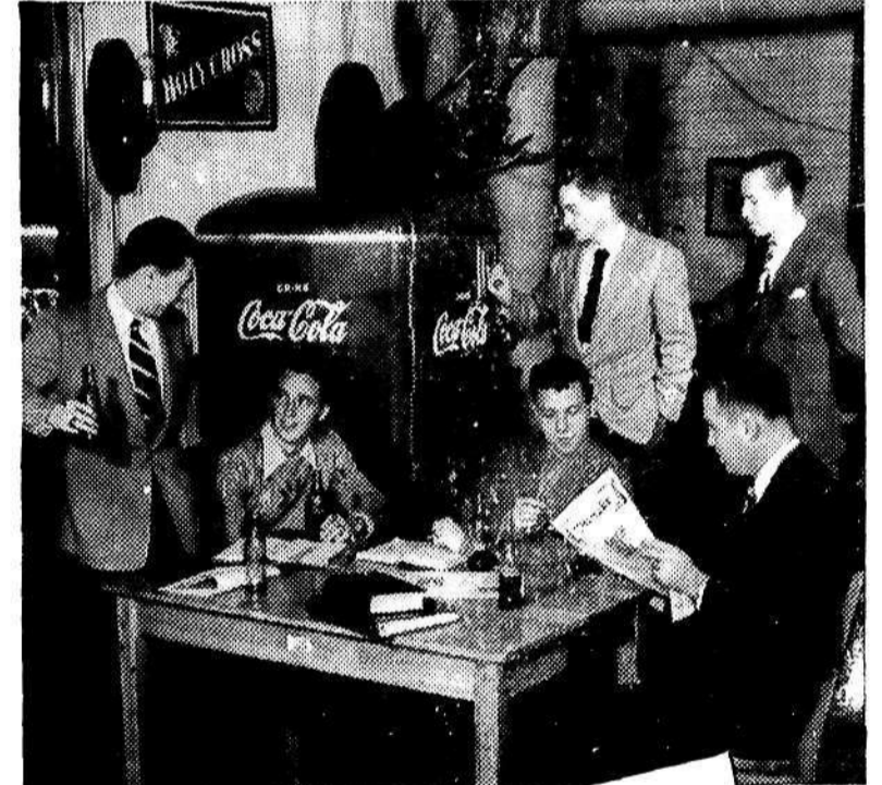
Day Room College of the Holy Cross (Worcester)