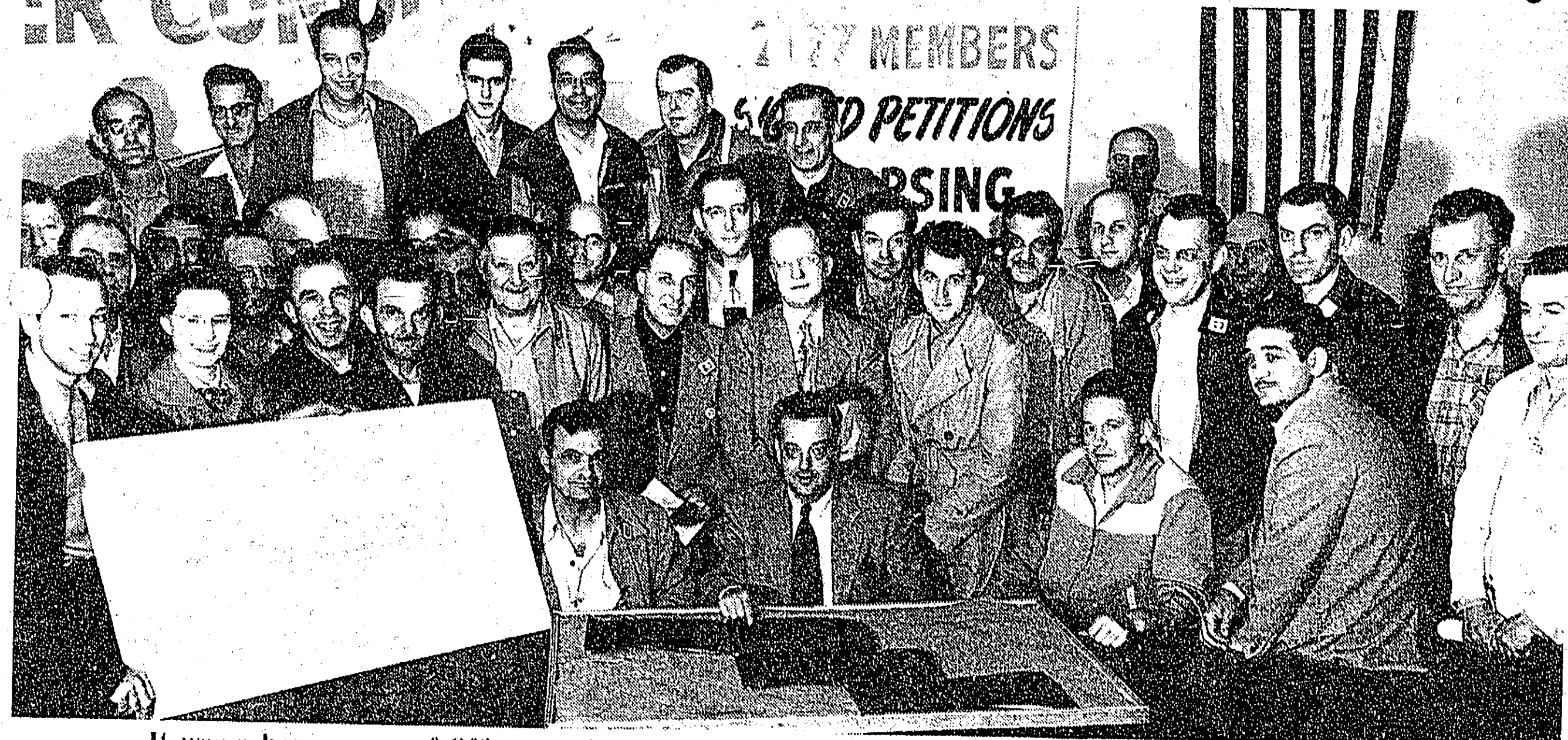
It was a happy crew of Officers and Board members that viewed final plans for our new Headquarters.

As soon as we have our election and get the outsiders off our backs, construction will start on our new Local 301 Headquarters.