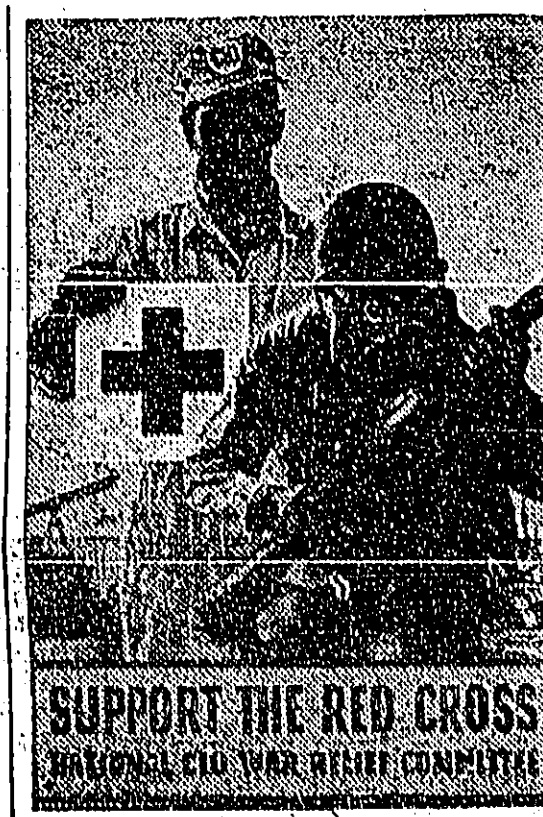
SUPPORT THE RED CROSS NATIONAL CIO WAR RELIEF COMMITTEE

The order, in addition to providing for merit increases for those who have not up to the present time received them, although they have qualified, provided for retroactive payments for those who received increases in 1944 between February 21 and August 24 and those who received increases between August 21 and January 31,