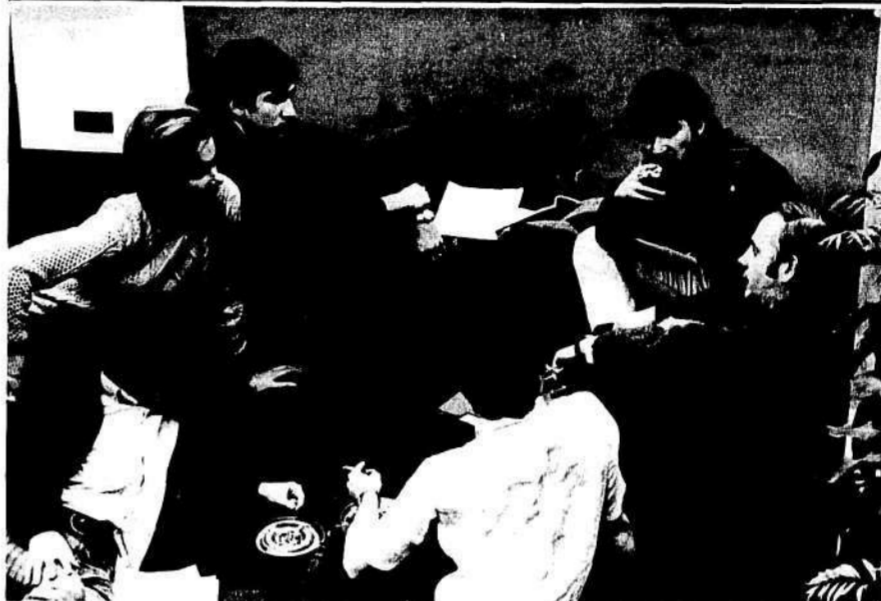
Students make constructive use of the two-day moratorium on classes by participating in various dialogues aimed at improving education and meeting problems of this University.

Vol. LVII No. 12 State University of New York at Albany Friday, March 20, 1970