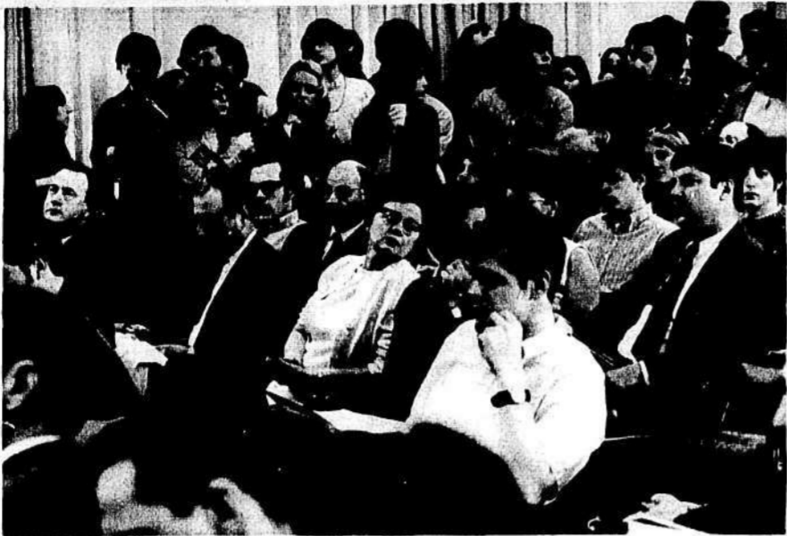
Calm again. Senate met yesterday afternoon and endorsed a proposal that the University be 'opened up' Thursday and Friday for dialogue.