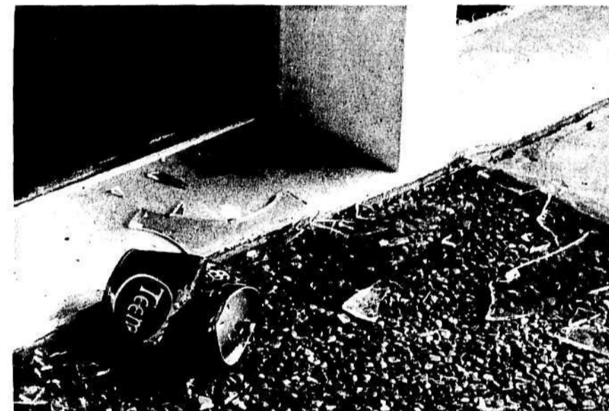
Saturday morning—the morning after, and the party's over.