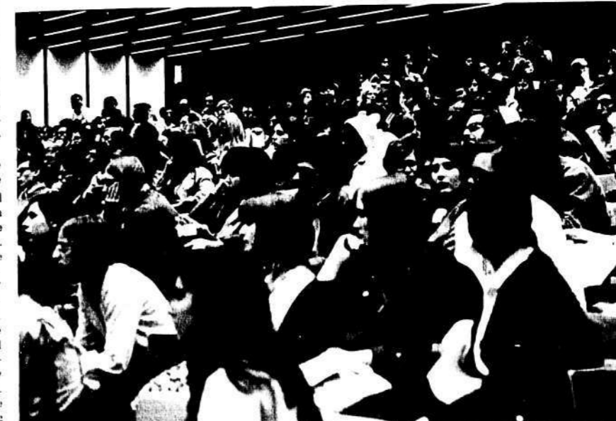
Yet another packed Lecture Hall. The day: Sunday. The topic: the 21 demands. The Reaction: confusion. --rosenberg

Though HYE may not be the most accurate of scientific methods it is one way to unite scientist and layman in an effort to attack a problem that has become critical.