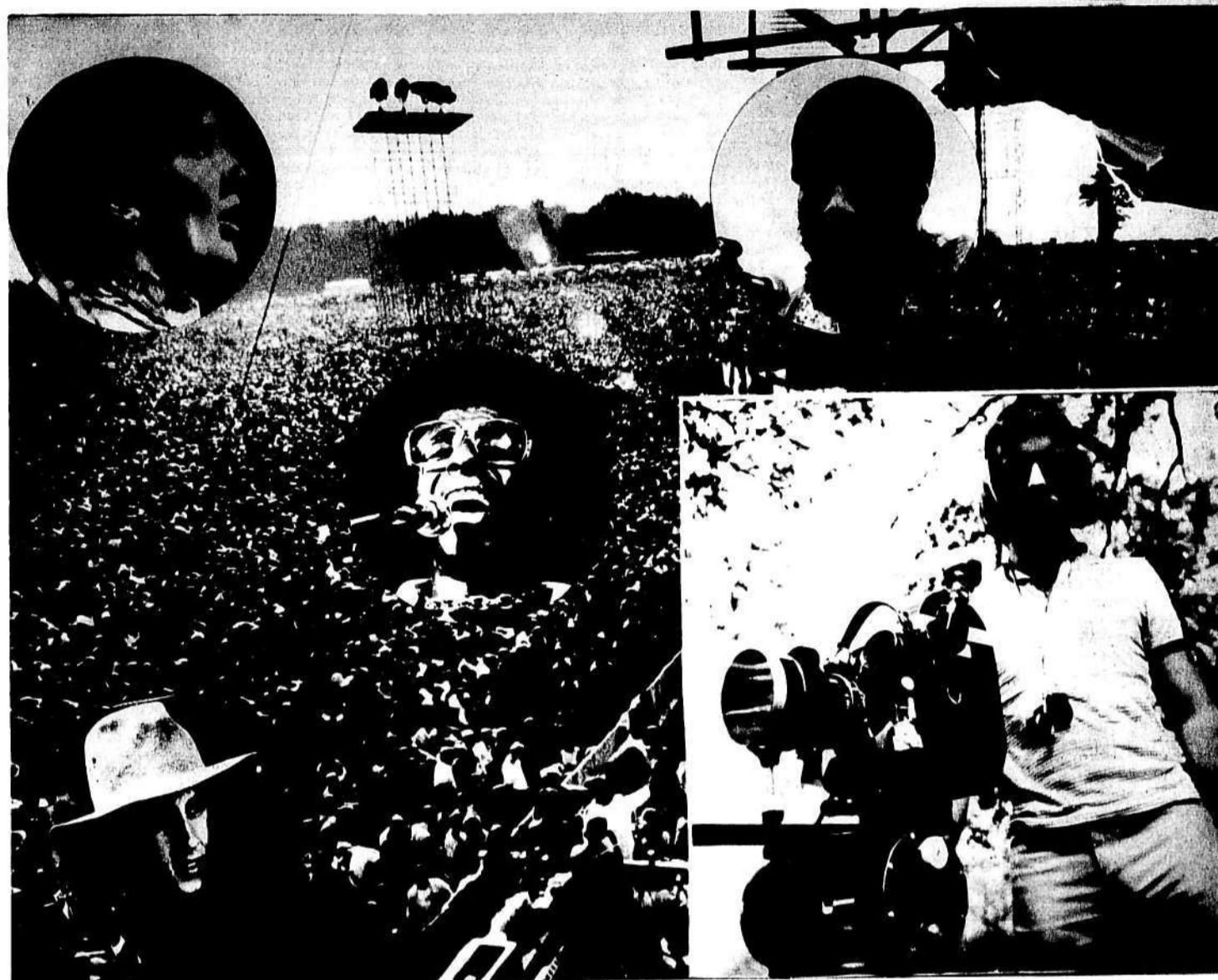
The mud, the masses, the music, and the madness that were Woodstock. Michael Wadleigh, lower right, made the film. Included are (clockwise from upper right) Richie Havens, Sly Stone, Arlo Guthrie, and Joan Baez.