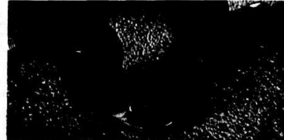
ERROR — These are not official police footwear, they are National Guard Combat boots. The Albany Student Press was in error to imply that the wearer was a policeman and we apologize to the doctoral student pictured in our tuesday ASP for our mistake. We have no evidence to infer that he is in any way involved with police work.

Meanwhile, the statements issued to the media state that all lawbreakers will indeed be prosecuted.