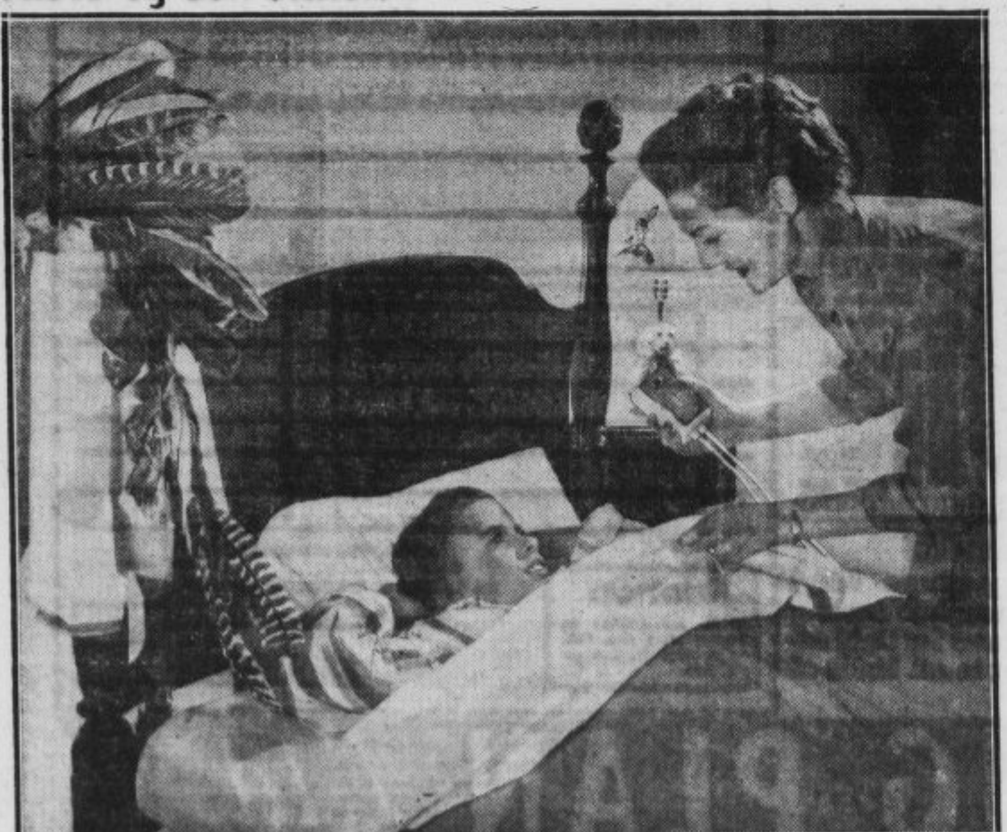
Winter-Proof. If the temperature drops tonight, Mother won't worry. Billy's automatic electric blanket - set to the warmth he likes-will keep him cozy even on wintry nights. Cost for electricity? Only about 25 to 36 on a cold night. Con Edison electricity is your biggest household bargain!