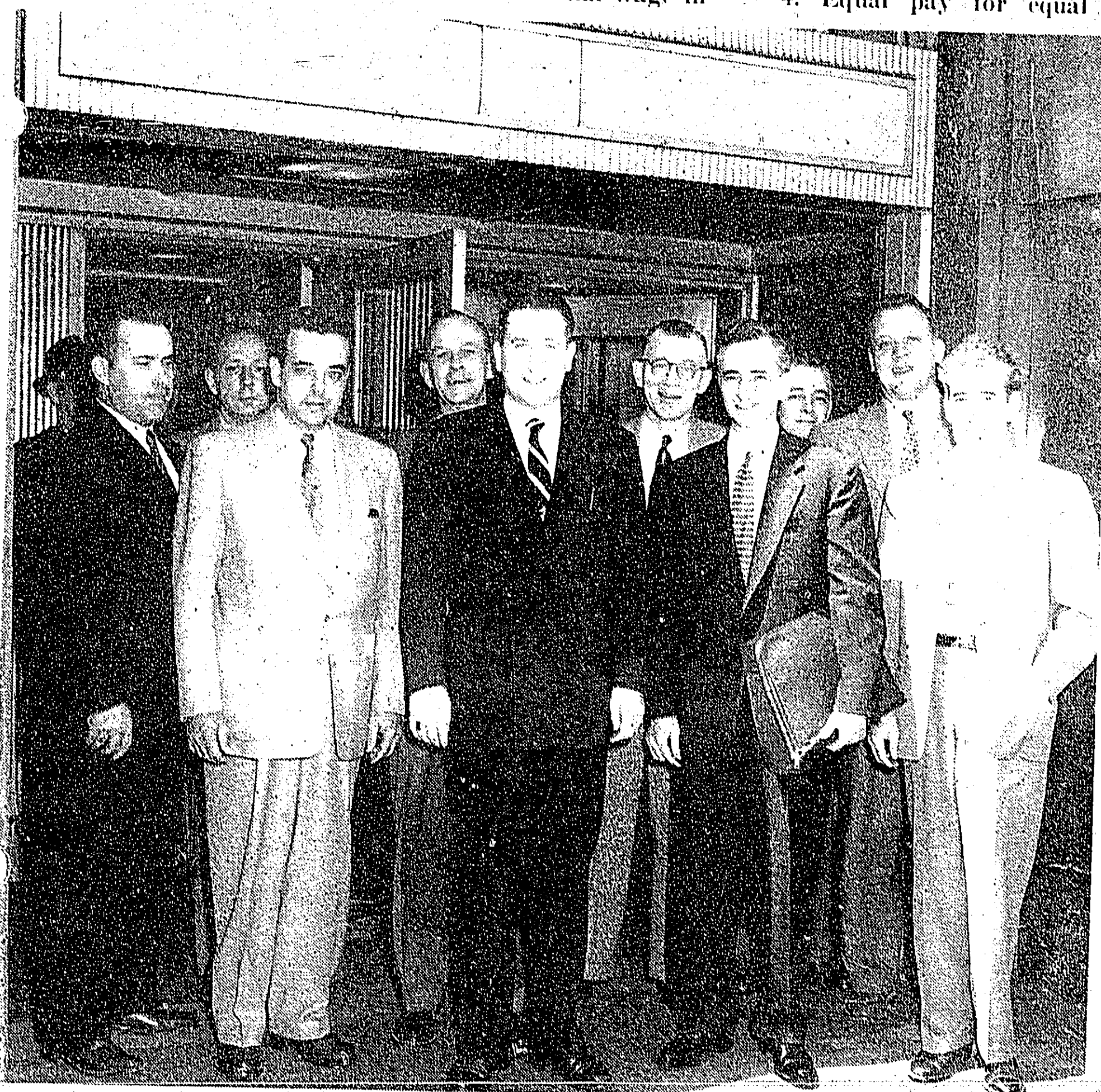
100,000 STRONG—Members of the IUE-CIO GE Negotiating Committee as they emerged from GE headquarters in New York City after their first meeting with the Company Tuesday. Second from the left in front row is Local 301 Business

Unity at the bargaining table is the key. Therefore, let's consolidate our ranks for the election. Then when we have the outsiders off our backs we can really get down to the job of negotiating and make GE come across with some of the gains it has withheld in the past four years.