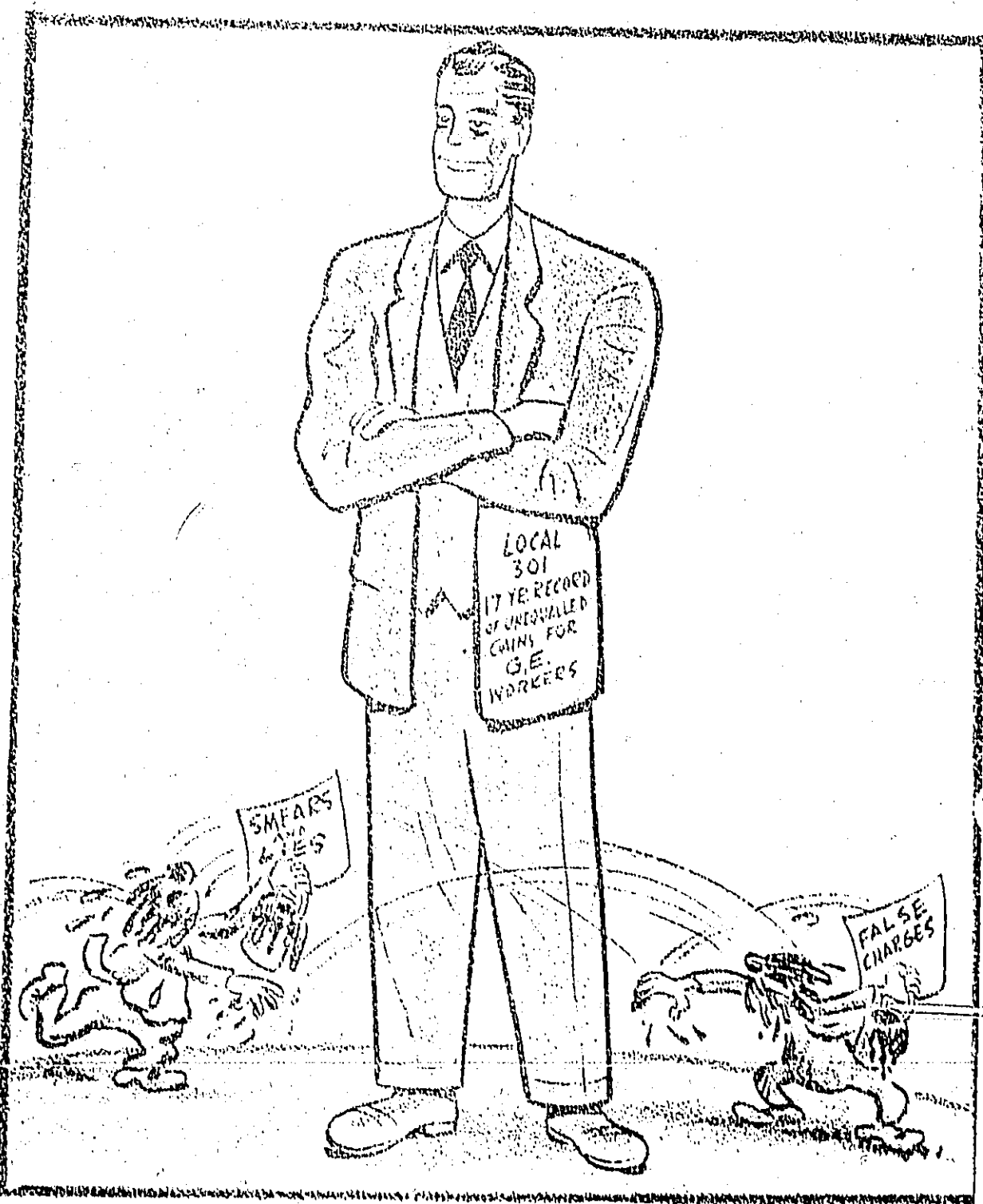
"Pipsqueaks . . . not good enough to carry the big guy's lunch bucket!"

The forces that seek to prevent unity of GE workers are powerful. They will stop at nothing. We have defeated them now. But we must be on guard in the future.