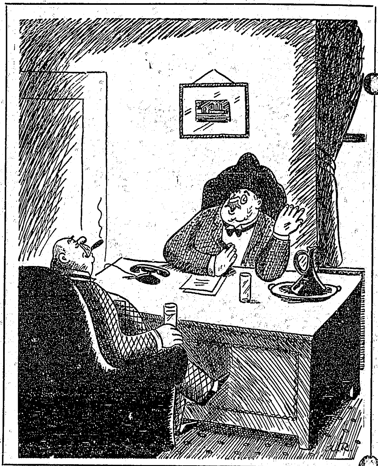
"I don't have to worry about taxes. My accountant says I'm a charitable institution."

Back the Contract Negotiations By Paying Your UE 301 Dues.