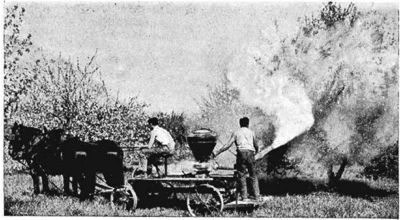
Students at the State Institute of Applied Agriculture at Farmingdale applying dust with modern equipment.

Farm training is as old as man himself. It embodies many types of preparation intended to make the individual farmer happier and more efficient. Until twenty-five years ago, in this country young men learned to farm by "pick-up" methods, incidental to the work on the home farm or on some other farm where employment could be se-