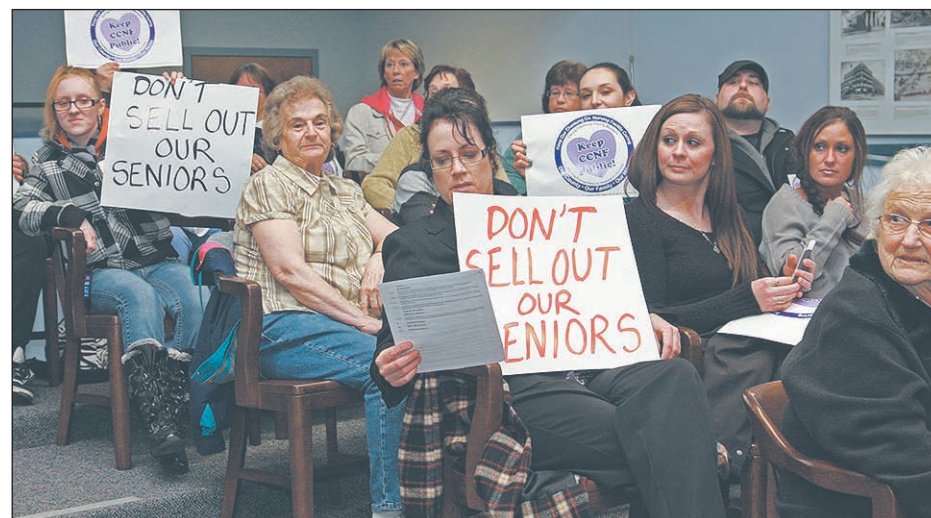
Supporters of the Chemung County Nursing Facility fill the legislative chambers to show their opposition to privatizing the county nursing facility.