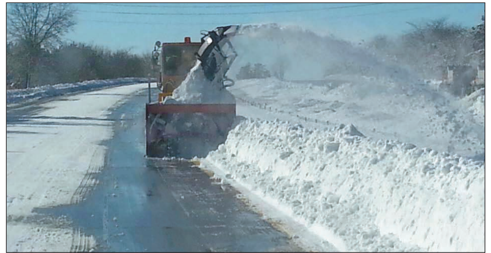
Department of Transportation crews from the Hudson Valley help clear the Long Island Expressway.

Espejo's crew worked an incredible 32 hours on the LIE, grappling with snow removal with the added challenge of thousands of abandoned cars littering the highway. Workers from that crew spent five days on eastern Long Island dealing with Nemo recovery, while CSEA members based at DOT