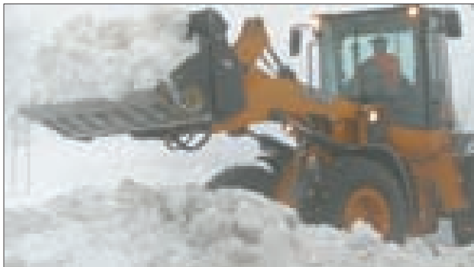
Town of Brookhaven Highway Unit member Billy Peters removes snow from a road.

Nearly 1,000 workers, including hundreds of state DOT workers from across the state, the state Thruway Authority and other state and local government agencies, as well as more than a third of the state's snow removal equipment, including more than 400 snow plows and more than 100 snowblowers, loaders and backhoes, were sent to Long Island by Gov. Andrew Cuomo to help with storm cleanup.