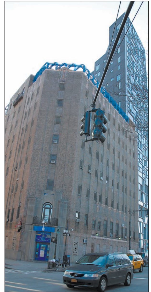
Bayview Correctional facility located next to high-priced condominiums and apartments that cost more than $10,000 per month.