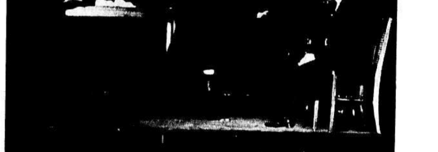
Rehearsal scene from State College Theatre Production being staged tonight and tomorrow night in Page.