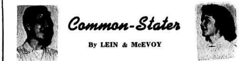
You are there

for anyone interested there will be a special Conservation field trip. Hip boots will be a necessity and all people interested in ruining a beautiful lawn should come. You exit at the Hawley Peristyle, turn right, and observe the plot of ground which was once a "campus," and at a later date a parking lot; at the present time, it would suffice for either.