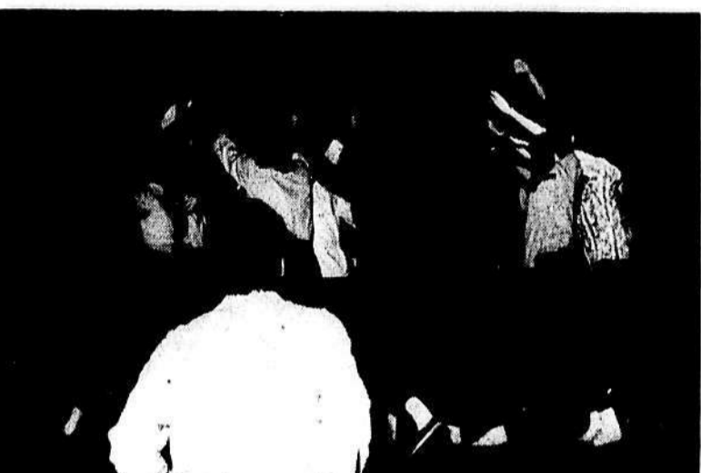
Pictured above is a rehearsal scene from the All-College Revue

After next week's Assembly the meeting will be held in Draper 340, Auditorium, because of the fact that Page Hall will be unavailable after March 26.