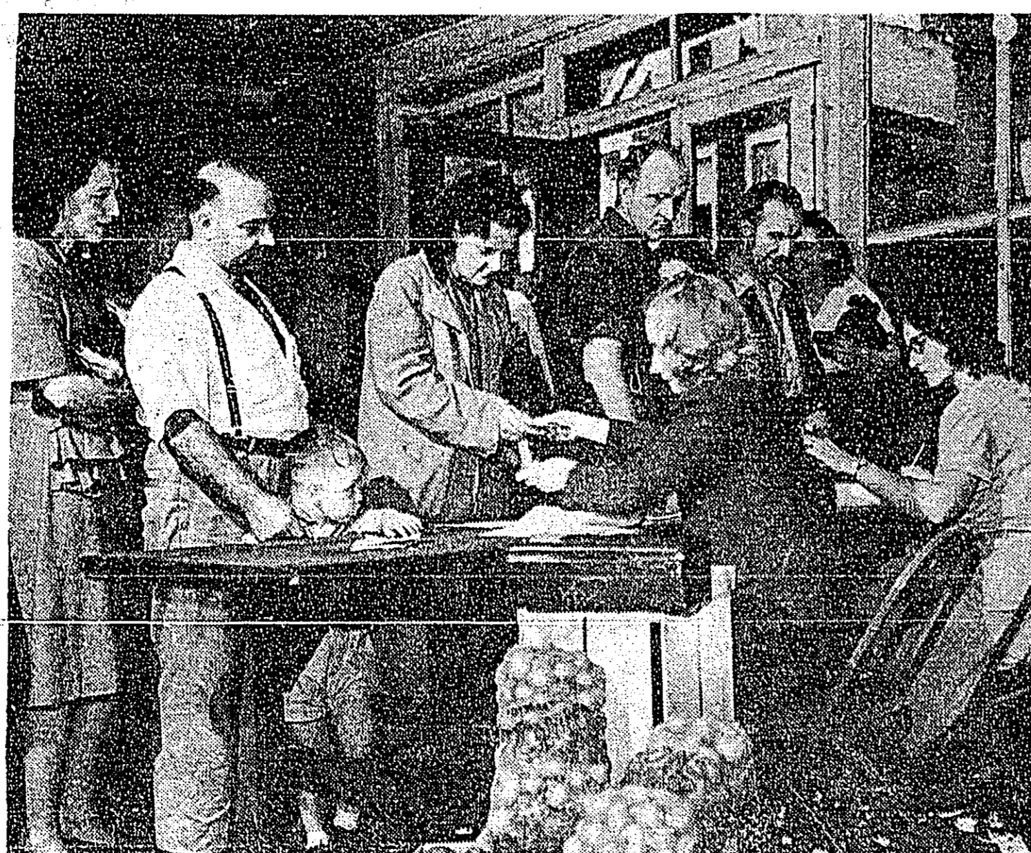
Busy day at the 301 Food Center. Cashiers from the union office hardly have time to take a deep breath, there's such a demand for the food bargains.