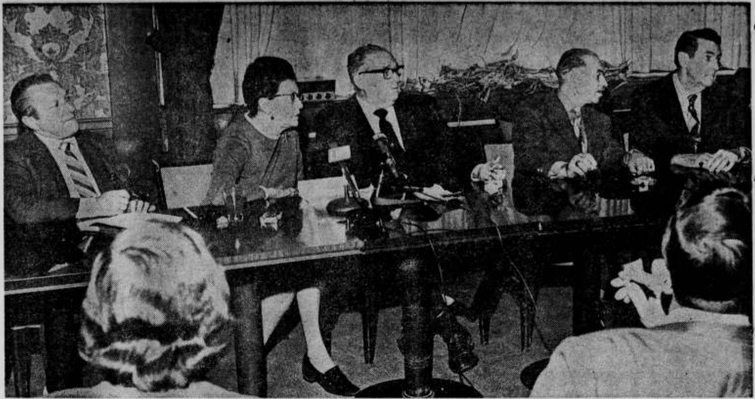
Calling for restorations of facilities and halt to deteriorating conditions at Pilgrim State Hospital are these CSEA leaders at press conference last