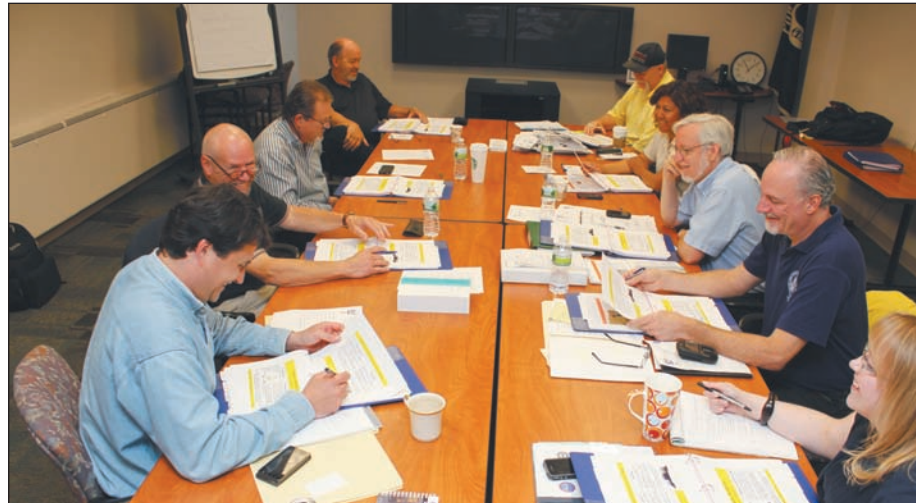
Representatives from CSEA, the International Chemical Workers Union, American Federation of Government Employees and United Auto Workers recently joined in a program-planning meeting at CSEA headquarters in Albany. The program aims to protect workers, communities and the environment.

ICWUC handpicked the following unions to help develop