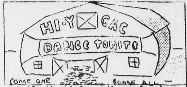
(Continued from other column)

The train home — a haven of rest for the weary, nevertheless, admiring eyes followed the troop of sailors in uniform who walked through the car.