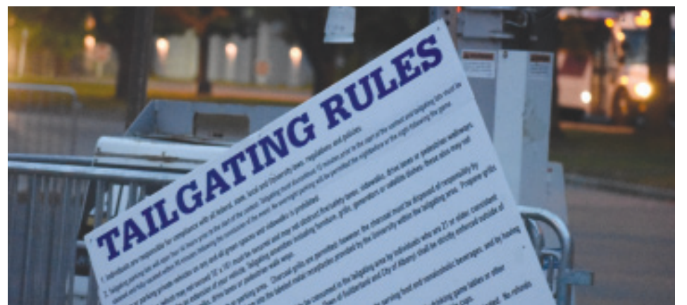
JOE HOFFMAN / ASP