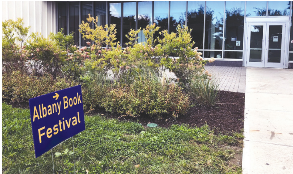
DALIA YAN / ASP