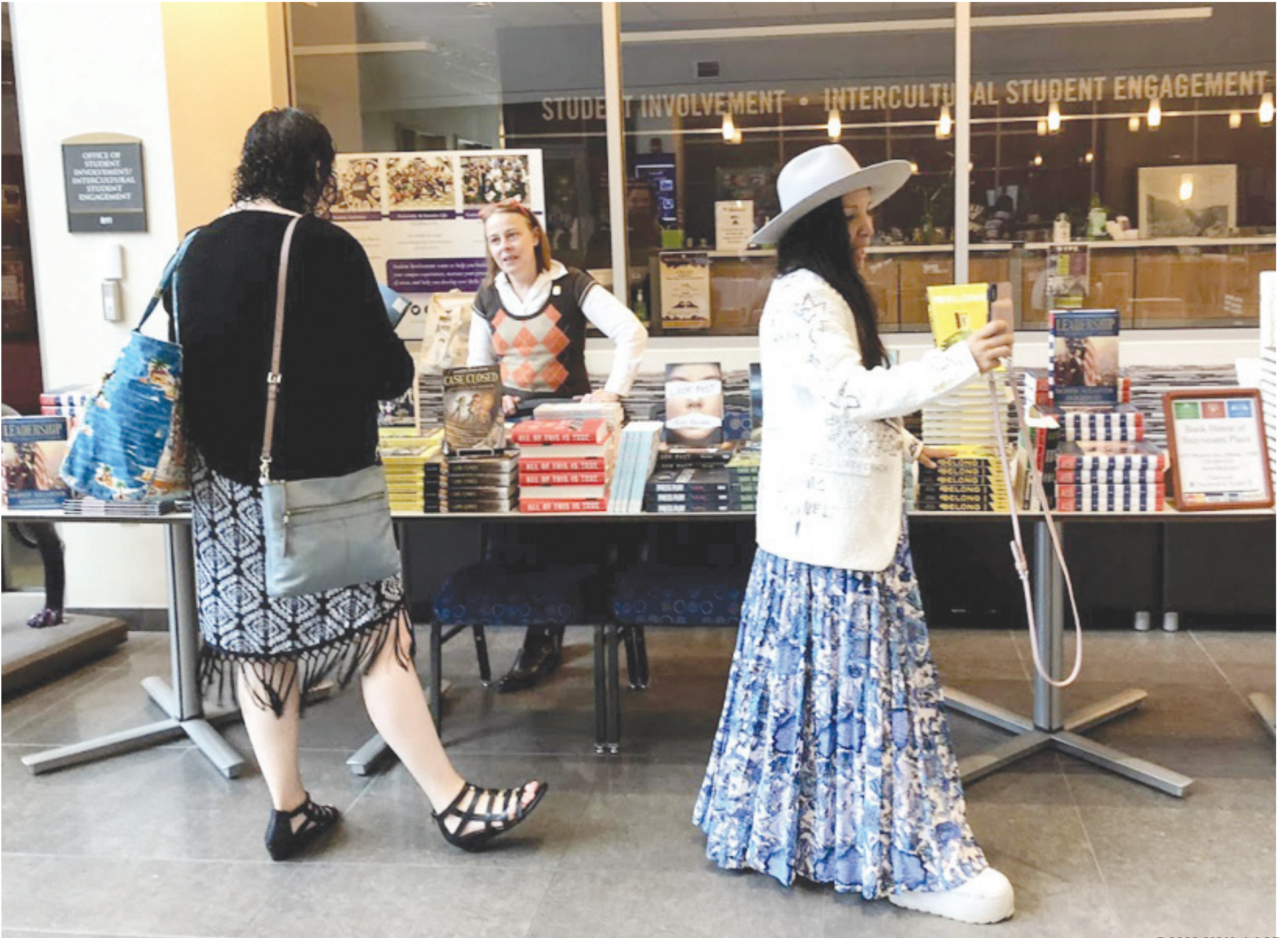
DALIA YAN / ASP