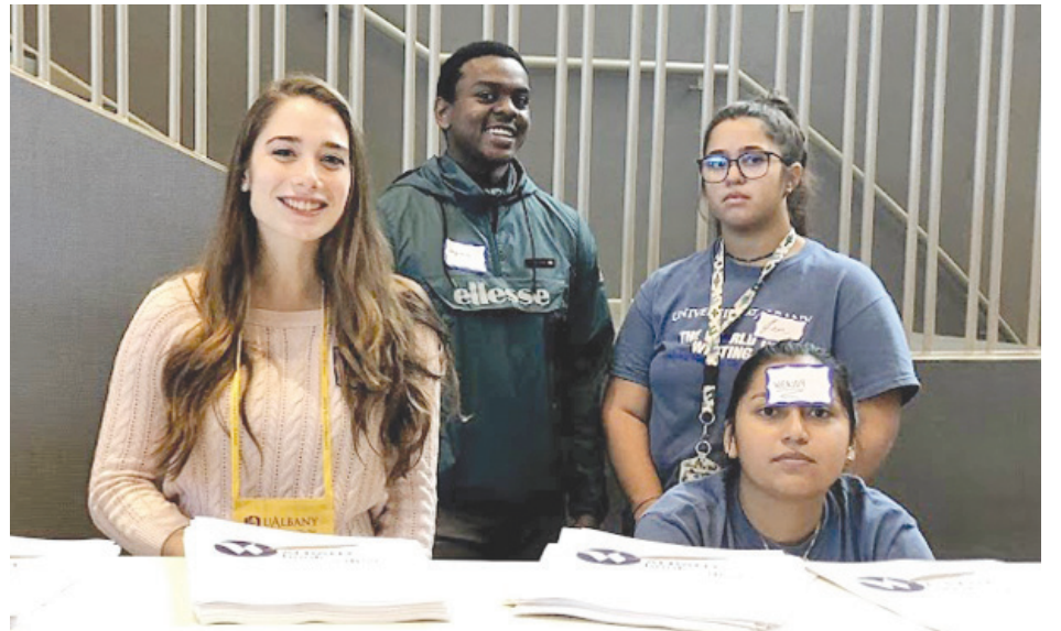
DALIA YAN / ASP