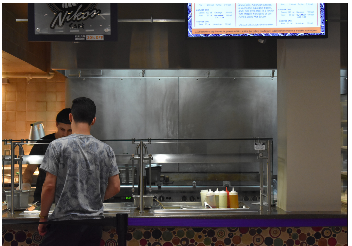
JOE HOFFMAN / ASP