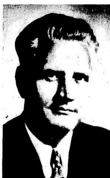
The Honorable Luther Youngdahl Governor of Minnesota

Future housewives and mothers, now you can get paid for practicing on somebody else's house and family. Iron, do light housework, go kiddyding. And you aesthetes, think of the beauty of modeling for art classes.