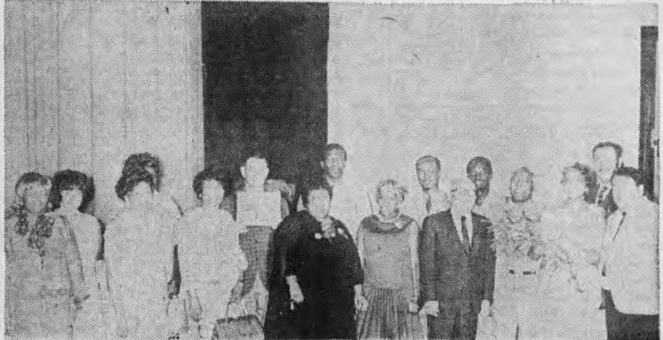
"Get Out The Vote" Rallies are being held throughout the State. Shown above are scenes from two of them.