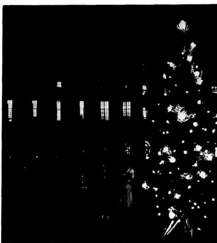
"Deck the halls with Boston Charlie." Frosh-Soph group prepares for the Christmas season.

The Air Force is seeking teachers to staff its Overseas Dependents Schools for the 1961-62 School Year. Their purpose is to provide public school educational opportunities in grades 1 through 12 to children of U. S. military and civilians stationed abroad.