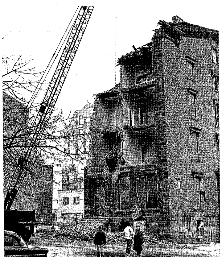
CHANGING THE ALBANY SCENE: In 1962, Governor Rockefeller announced that a 40 block area in downtown Albany was to be razed and cleared to make way for a new South Mall State campus for the capital city. At the end of the fiscal year 584 of the area's 1,150 buildings had either been demolished or vacated and under contract for demolition; and 1,102 of the 3,700 families living on the site had been relocated. Aerial photograph shows progress made in clearing land along eastern end of the South Mall area. Set-ins show demolition of a former executive mansion at Hawk and Lancaster Streets and Governor Rockefeller displaying bricks from a demolished structure to an obviously approving group of site residents.