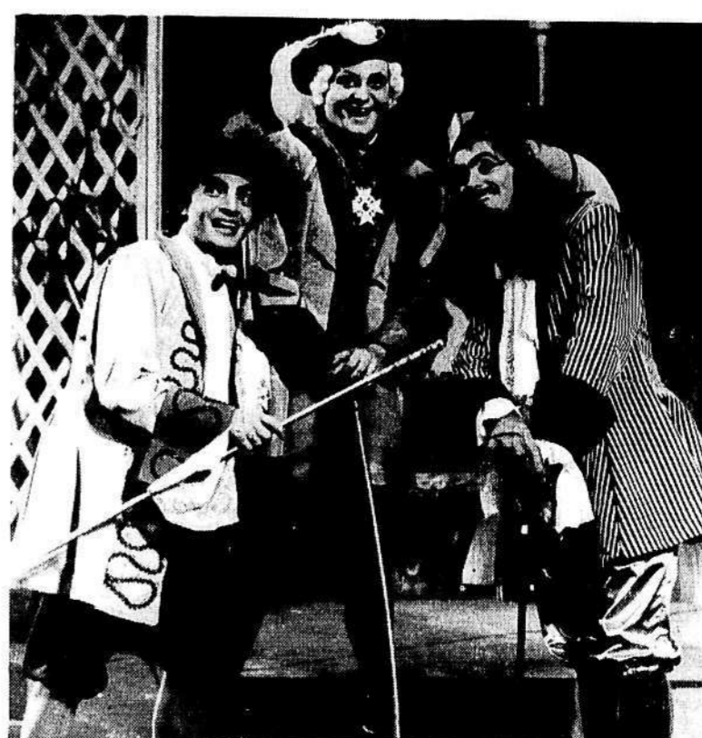
Members of the University Players troupe attired for their performance in "The School For Wives."