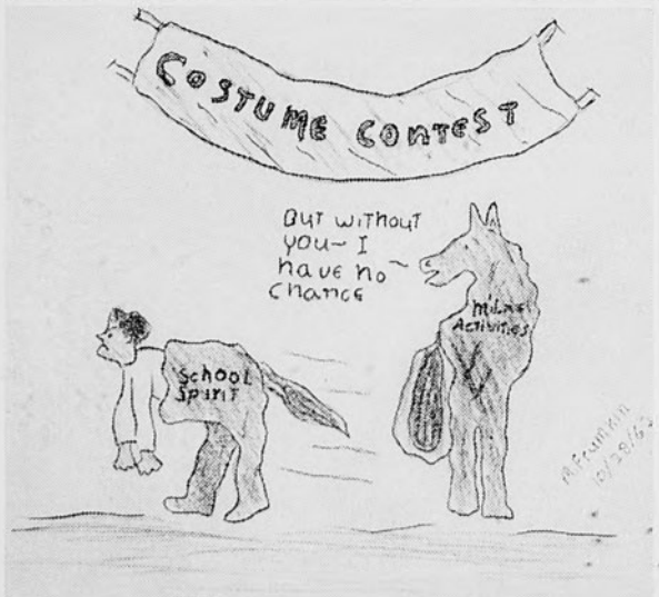
This is no masquerade!