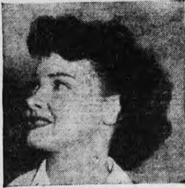
KATHRYN GRAYSON star of "Thousands Cheer," MGM musical openings at the Astor on Tuesday, Sept. 14