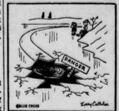
"Mom, do we have Blue Cross for Daddy?"