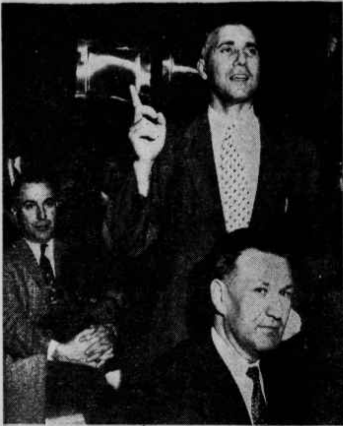
Photo Report Shows Meeting In Action