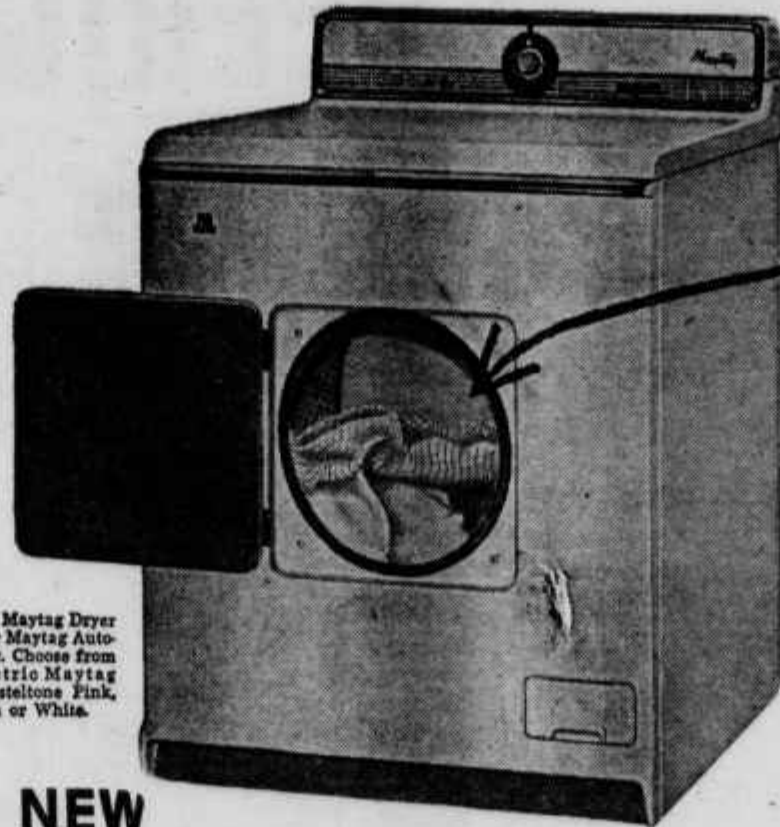
You can get a Maytag Dryer to match your Maytag Automatic Washer. Choose from 8 gas or electric Maytag Dryers in Pasteltone Pink, Yellow, Green or White.