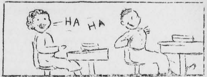
CLASSY CRACKS III

In English class, each pupil is responsible for reporting on magazine articles in different magazines. In checking up, the teacher asked,