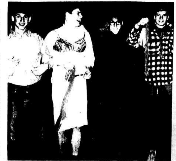
PANTY RAIDS WERE staged Wednesday night by boys on both Dutch and Colonial Quads, and the girls reciprocated on Thursday.

The program will include active audience participation and will be followed by a coffee hour and informal discussion period.