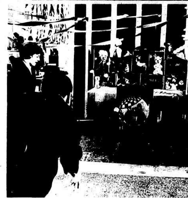
STATE FAIR, the culmination of a highly successful Campus Carnival Week was held Sat. Almost $1,000 was raised for Ambassador Program.