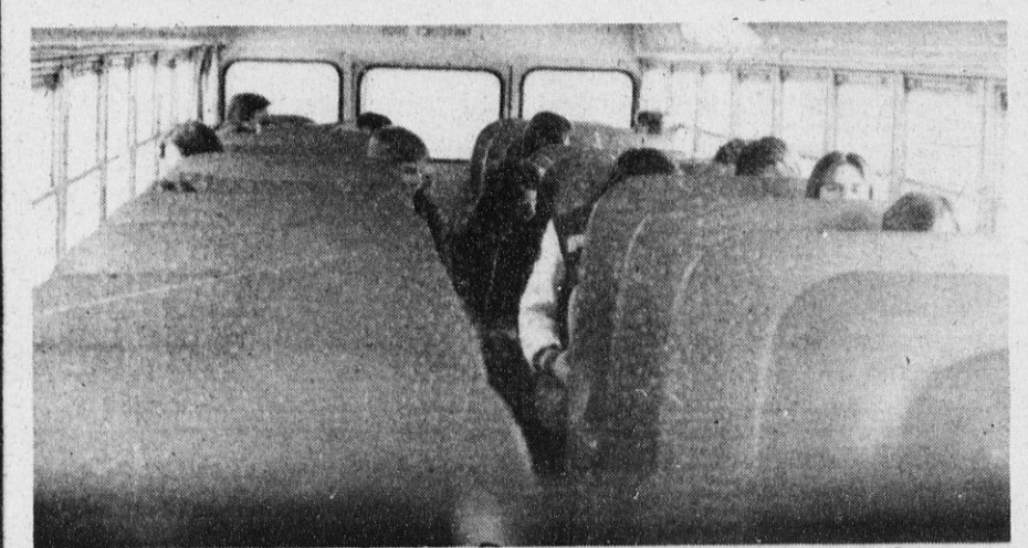
DIFFERENCE IS CLEARLY EVIDENT between higher backed seats and lower backed seats in these two photos taken from a school bus driver's seat and through the driver's rear view mirror. In the newer, 28-inch high seats, left, these high school students are barely visible in the

"I don't know. I hope so. It would be a heck of a sense of satisfaction to know that all that time has been well spent, that I'd accomplished something."