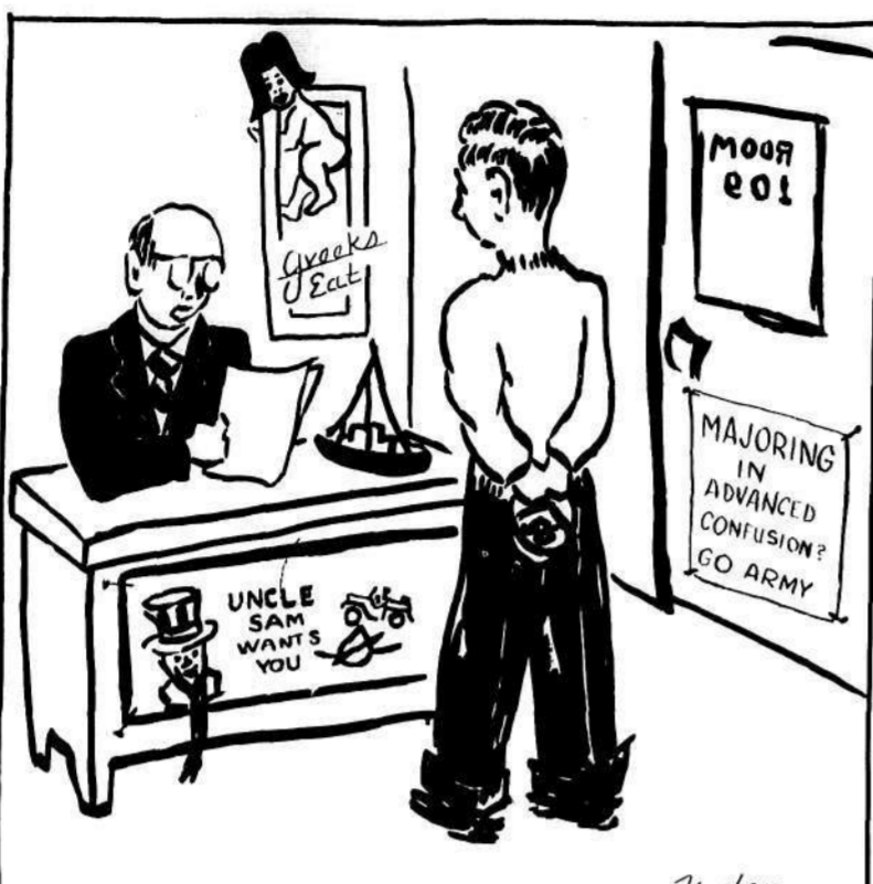
"What are we going to do with you? This report shows you're thinking half your courses."