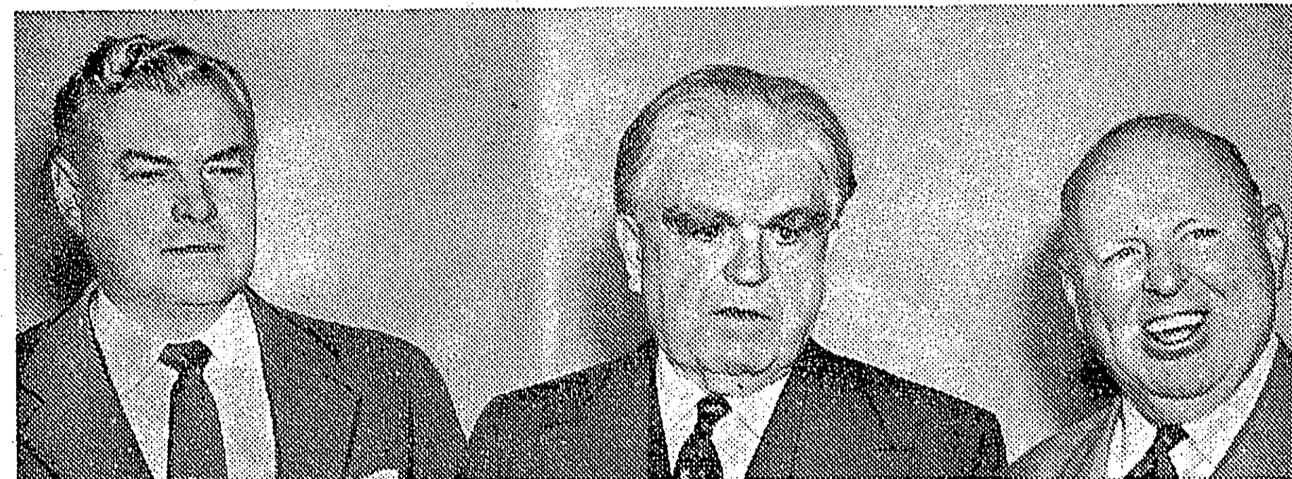
Shown above are left to right President David McDonald, CIO Steel; President John L. Lewis, United Mine Workers (Ind.); President Dave Beck, AFL Teamsters. Following a meeting of the three that again

stirred speculation that steel was quitting the CIO, Lewis declared over NBC television last Sunday: "Neither the present leadership of the AFL nor of the CIO are protecting the interests of their vast memberships."