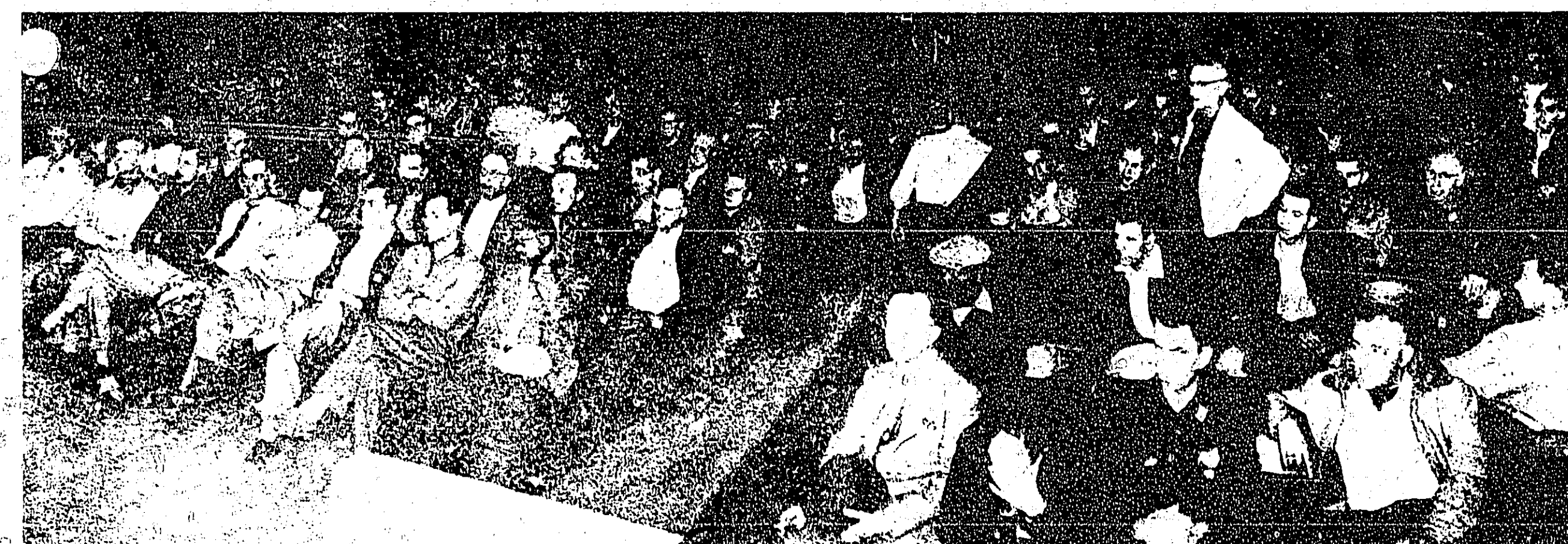
Turbine Stewards as they met Tuesday to reaffirm decision to unite the GE chain in IUE-CIO.

ABOVE is the faked photograph as it appeared in last week's IUE-CIO paper. GE workers were quick to note the tell-tale diagonal line that showed where the picture had been doctored. Purpose of the fraud was to cover up the fact that the Carey clique is completely discredited in Turbine.