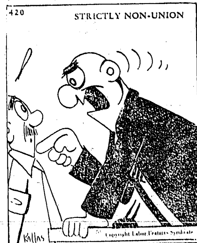
"Now look here, Hampton, I'm a busy man! I can't have you popping in and out of here every year asking for a raise!"

The following is the program and time schedule for the entertainment events that will take place at the Field Day: 12:30 to 1:00 P.M. — De Dio's Animal Circus 1:00 to 2:30 P.M. — Little League Game 2:30 to 3:30 P.M. — The Heerdinks (Acrobats) 3:30 to 4:40 P.M. — Wrestling 4:40 to 5:30 P.M. — Boxing 5:30 to 6:00 P.M. — De Dio's Animal Circus 6:00 P.M. — Drawing of prizes 7:00 P.M. — The Heerdinks (Acrobats)