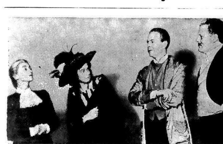
The Dublin Players in a scene from Pygmalion