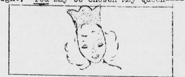
What To Do When You've Got Nothing To Do And Loads of Time To Do It

Be on your very best behavior tonight. You may be chosen May Queen----