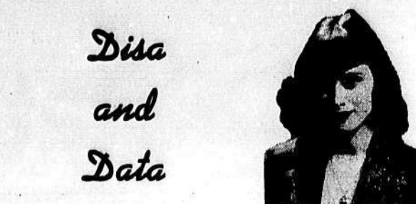
Disa and Data By MINDY WARSHAW

The recent Inter-Group Council conference is still echoing repercussions throughout the State.