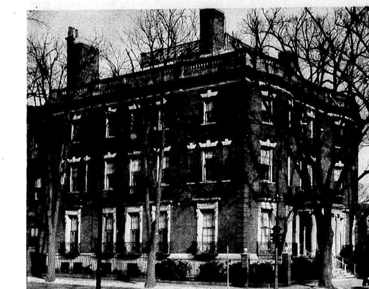
The building at 465 State Street has been purchased by the Benevolent Association of State College as the new residence hall for the returning veterans studying here under the GI Bill of Rights.