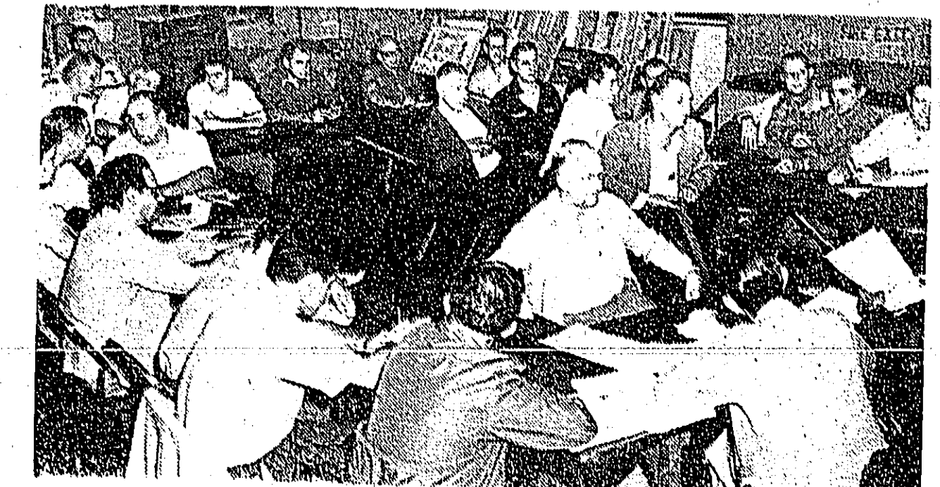
SUMMER SESSION—UE Local 301's executive board is pictured above as it held its first July meeting on Monday night.

A $25 contribution to help the work of the Schenectady Girls' Club was voted Monday evening by the UE Local 301 executive board. The donation was in the amount asked by the organization which provides recreational and child-care facilities for the city's youngsters.