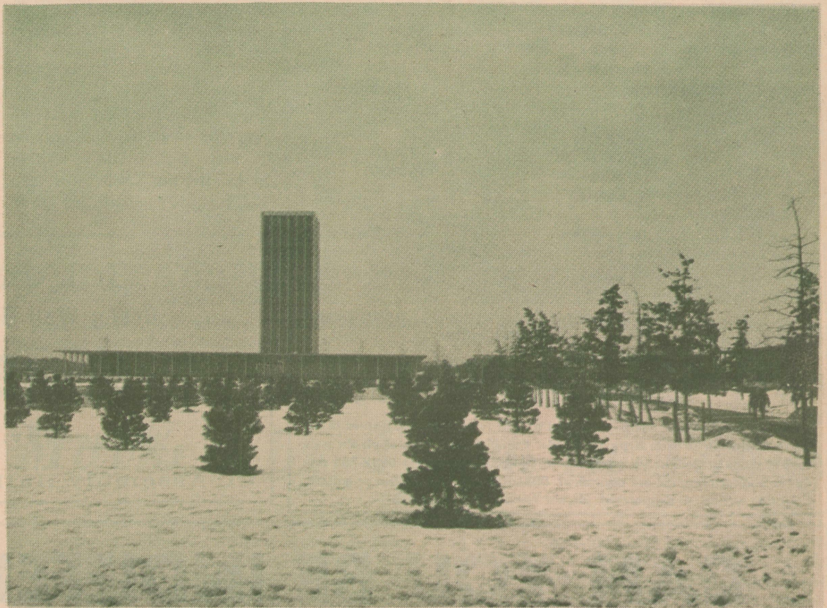
Voting for the proposed Student Association Constitution will be held in all the quads as well as the Campus Center today, tomorrow, and Wednesday.