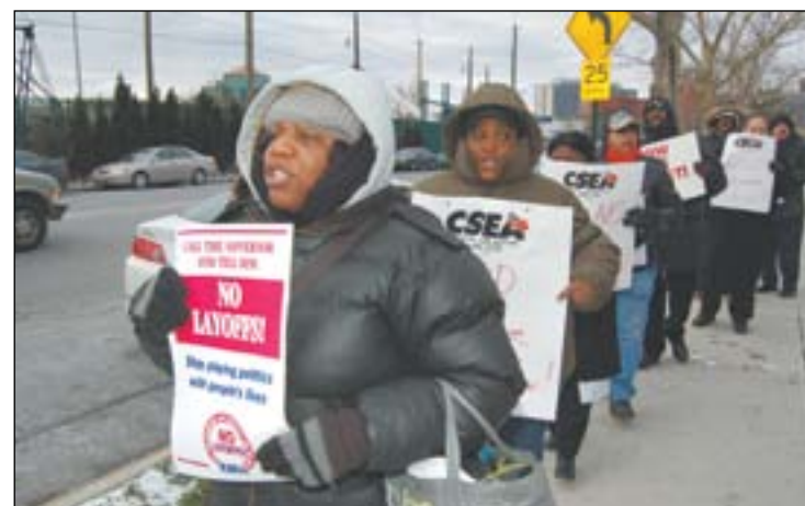
Bronx Psychiatric Center workers demonstrate against layoffs in this December 2010 file photo. (See the January 2011 Work Force for more.)

In early January, a male patient in a ward died after an altercation with another patient. While the death is still under investigation,