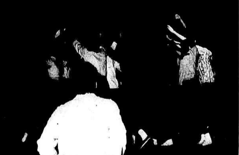
Pictured above is a rehearsal scene from the All-College Revue

After next week's Assembly the meeting will be held in Draper 340, Auditorium, because of the fact that Page Hall will be unavailable after March 26.