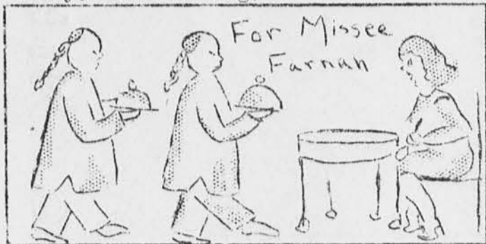
OVER THE WEEKEND

Outright invitations are his party. He's engineering the plot, so let him carry it through. Though paying your own way may make sense to the girl, it may not to the lad who likes to do the honors. It doesn't matter what time of day it is, or whether you're wearing a sloppy sweater and saddleshoes, or swishing your long skirts in a cloud of perfume. You're going places on his money. He's willing!