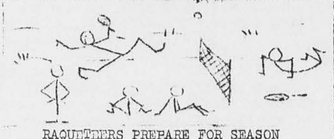
RAQUETEERS PREPARE FOR SEASON

The J.V. bowed to defeat at the hands of the Schuyler J.V. game was high for the Milne Junior Varsity.