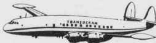
FLY IN TRANSOCEAN'S LUXURIOUS "ROYAL HAWAIIAN" CONSTELLATIONS

You'll love it! You Can Afford It! The Greatest Holiday Vacation ever offered