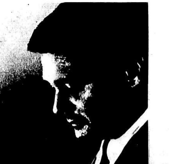
STAN GETZ, ACCLAIMED jazz saxophonist and trend setter in the music field, will appear in concert tonight at Page Hall. The event will open Homecoming weekend.

This year's co-chairmen felt that the panel selection overemphasized the qualities of speech, poise, and maturity undervaluing attributes such as personal appearance and physical beauty. This year's procedure involves both panel judging and direct election by all Student Association members. A panel of seven judges selected 12 candidates from over 40 as semi-finalists. The finalists, including the queen