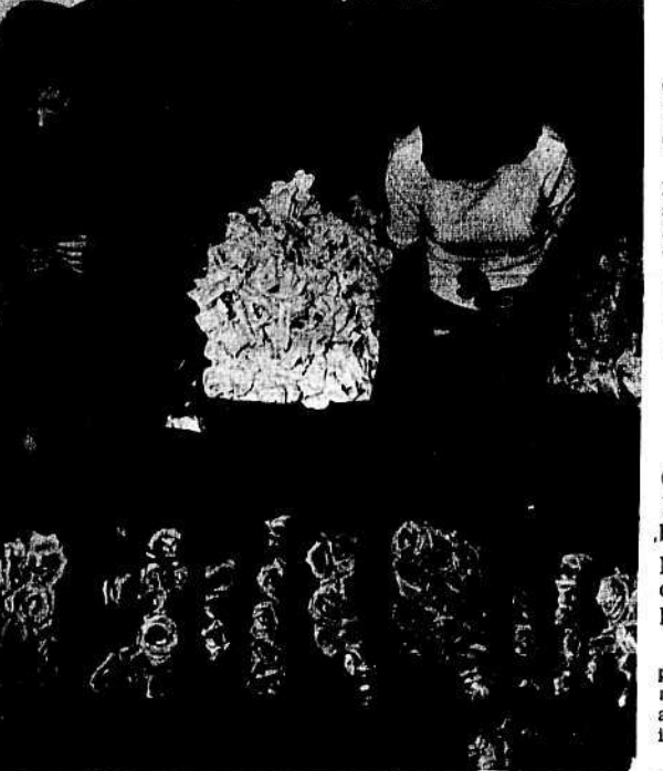
MEMBERS OF BETA ZETA sorority prepare their entry in Saturday's parade. The procession will boast over twenty floats.

Queen Announced The Great Danes face State University College at Potsdam in the Homecoming soccer game immediately following the parade.